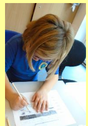
Sketching techniques using B, 2B, 3B, 4B, 5B, 6B and graphite pencils