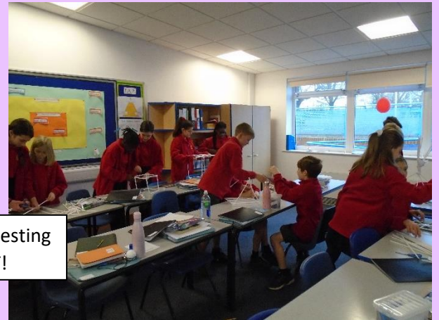
Making frame structures and testing their effectiveness for DT!